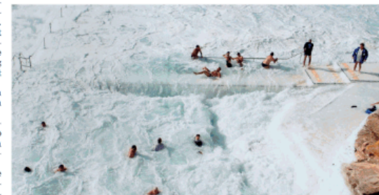
The challenge of the ocean adds another element to Icebergs pool.

"Anything that is intimately connected with the beach needs to be protected and looked after," Kulakauskas said. "It's an integral part of that landscape".