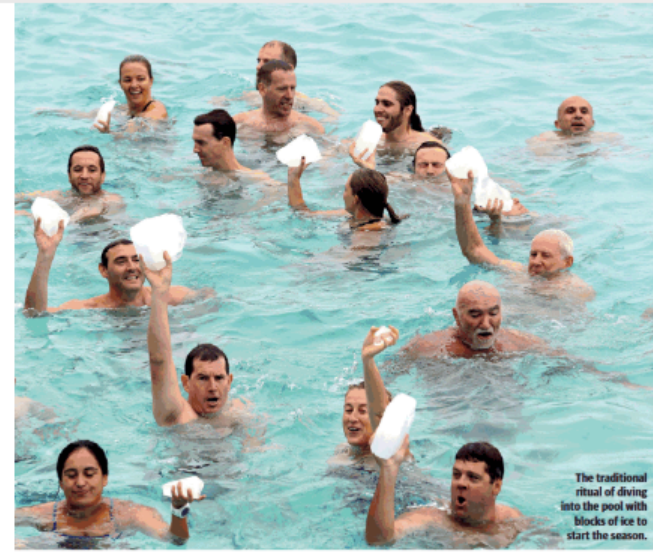
The traditional ritual of diving into the pool with blocks of ice to start the season.

a liquor licence. It expanded over two floors a decade later.