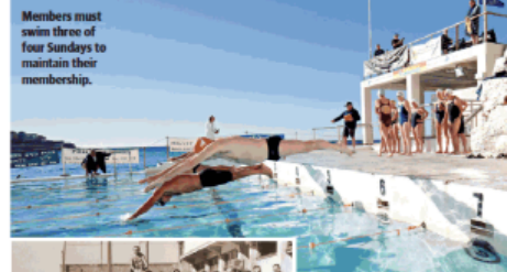
Members must swim three of four Sundays to maintain their membership.